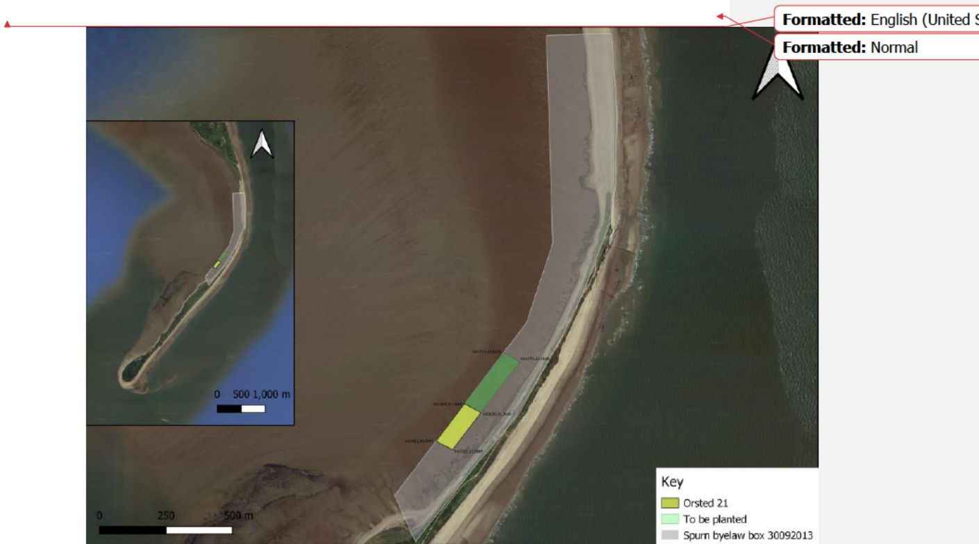
Figure 1: Seagrass restoration at Spurn Point, Humber Estuary. 'Orsted 21' illustrates to the area planted in 2021 for Hornsea Four and 'To be planted' is the remaining area to be planted in 2022-2023 to total 4ha of seagrass restoration.

3.1.1.2 The trial seagrass restoration efforts within the Humber Estuary including seed collection and planting of intertidal seagrass ( Zostera noltii ) and has been undertaken by the YWT. Further studies of the seagrass restoration scheme are being conducted by the University of Hull, these aim to monitor the success of the restoration effort, effects on fish assemblages and abundance and demonstrate fish connectivity to wider North Sea populations through stable isotope analysis. The methodology for trial planting, includes the use of hessian sacks filled with substrate and seagrass seeds, which are deposited into the intertidal area using a tree planting tool (pottiputki), with 1000 seeds planted in a half-acre area. It should be noted that the restoration works, are being carried out by an external provider, the YWT, and as such the methodology has been devised and any licences or permits required to restore seagrass within the Humber Estuary have been obtained by the YWT. The area within which the trial planting is taking place is Spurn Point, this location was selected by the YWT as they own the foreshore.